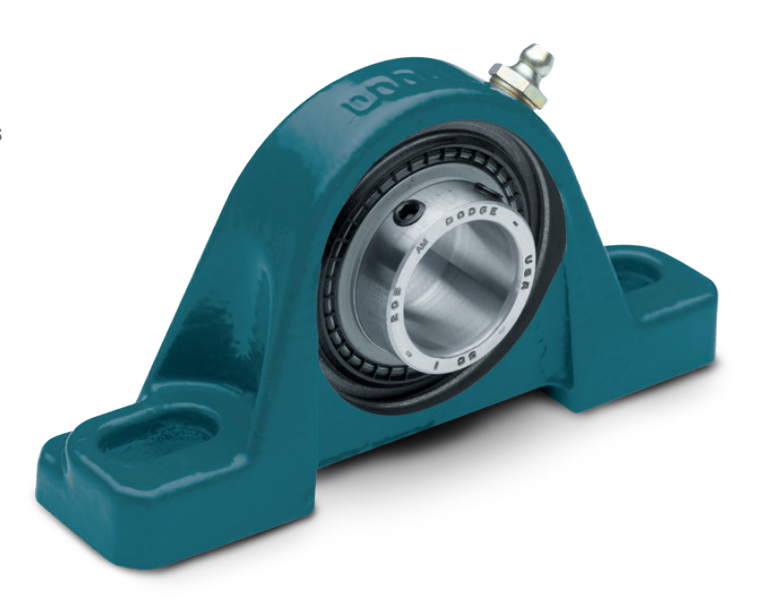
Extreme Duty is available in multiple housing and shaft attachment options

The Extreme Duty mounted ball bearing uses premium synthetic grease to provide low operating temperatures, extend grease life, and maximize time between re-lubrication.