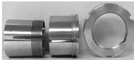
Adapter Sleeve Bushing Sleeve Locknut